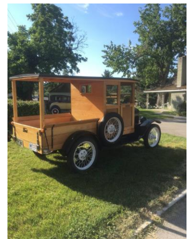
1925 Model T Huckster $9800 ☎ (208) 871-6814

1941 G-505 Dodge WC-15 Command Reconnaissance Car for sale. 1 of just 3,980 made. Running when parked by previous owner, although he mentioned it might need new wrist pins. Good tires. Stoughton cab has rust, but doors open and close good. Dump bed is body model 08247-Z "Budd" 108" long x 70" wide. It has Collector Plates on it. OBO ☎ (509) 439-3599