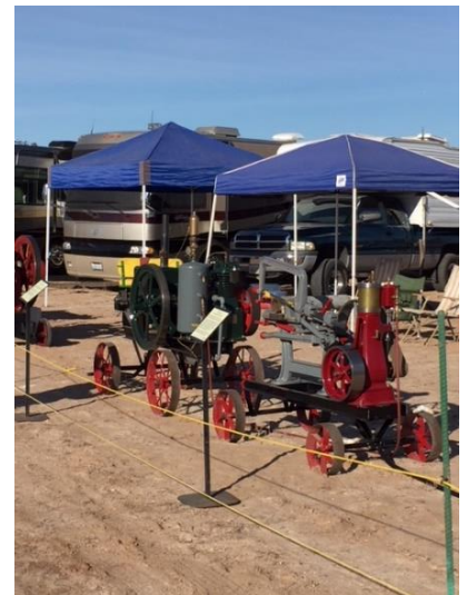
Motor Homes and Travel Trailers lined up facing the engine displays making it easier for participants to tend to their engines and be closer to their creature comforts. Buster Brown claims this is said to be a "patented show layout" .