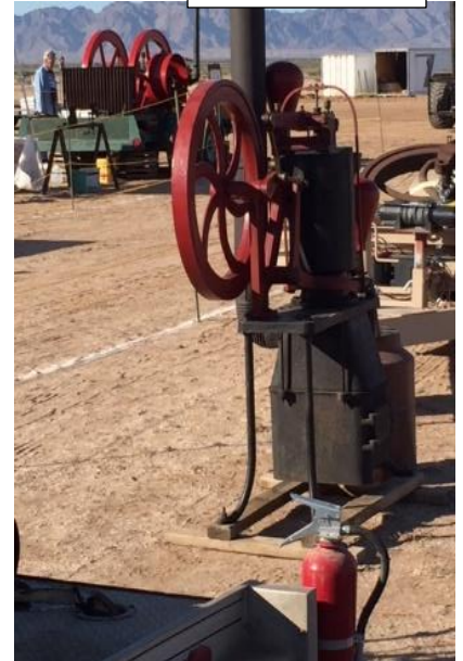
Hot air Engines gathered for the Southwest Forgotten Iron Show Jan. 19-20 2018 in Welton Az.